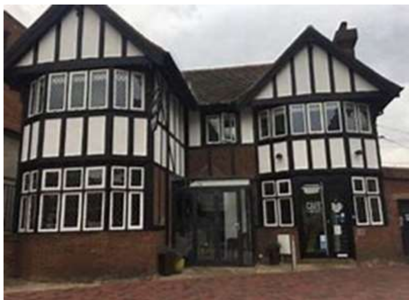
TCS's home at Gilbert House