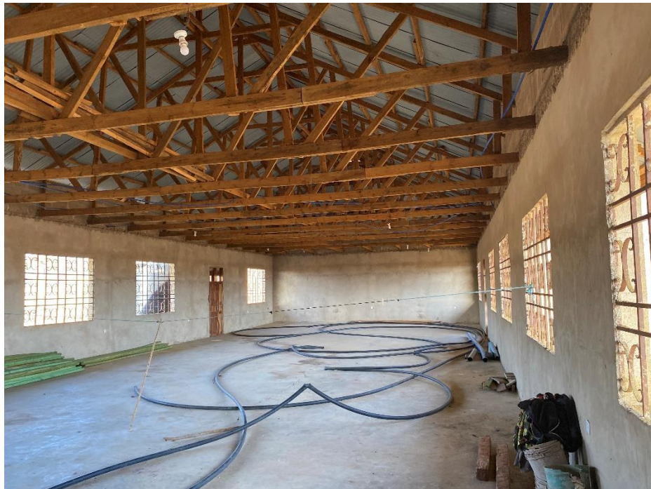
The Dining/Assembly Hall close to completion in October 2023