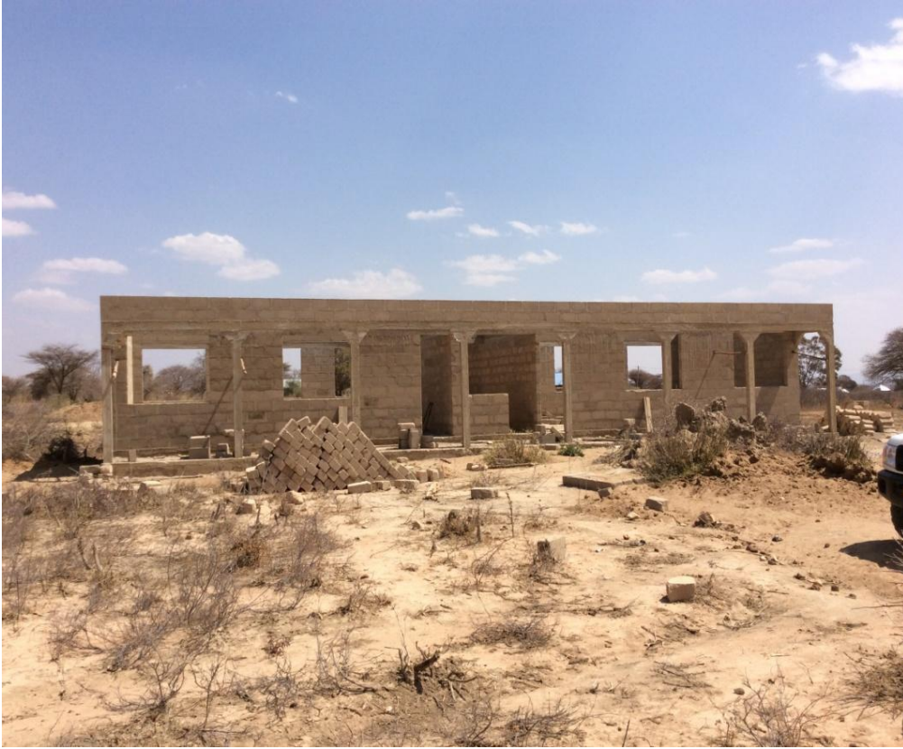
The construction of two classrooms in July 2018