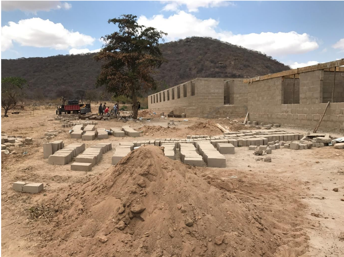
The Chemba Girls and Boys Dormitories emerging from the ground in August 2017