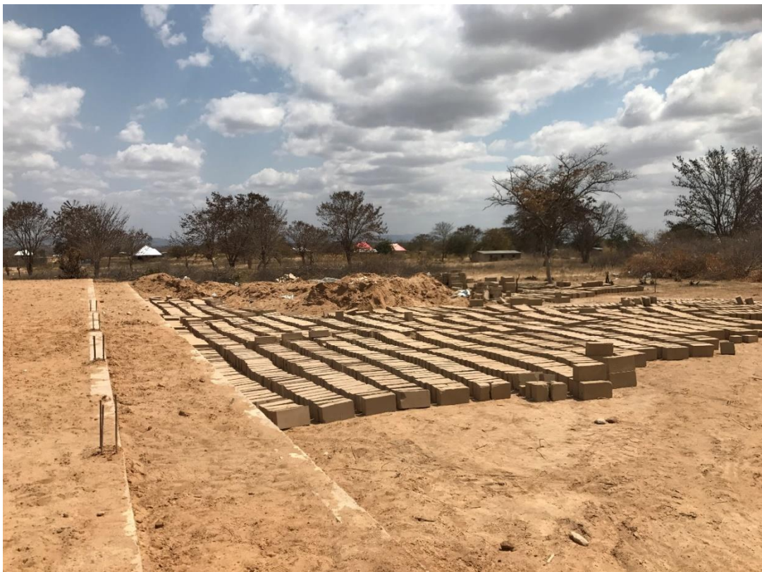
The Foundations of the Dining/Assembly Hall in August 2017