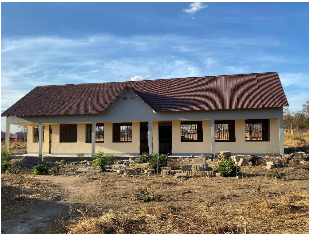
Classrooms completed by October 2023