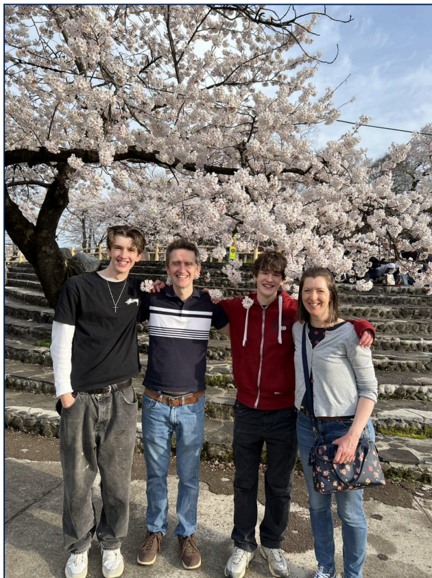
Enjoying the cherry blossom in Hanamaki